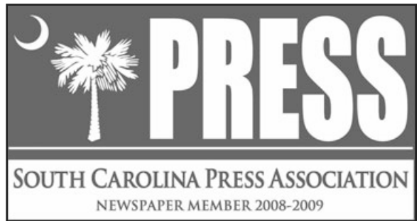
CAR WINDSHIELD PRESS DECAL